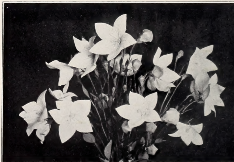
BALLOON FLOWER Platycodon

COWSLIP PRIMROSE, P. veris . Clusters of yellow, cream, orange and rose blossoms in May and June. 12 in.